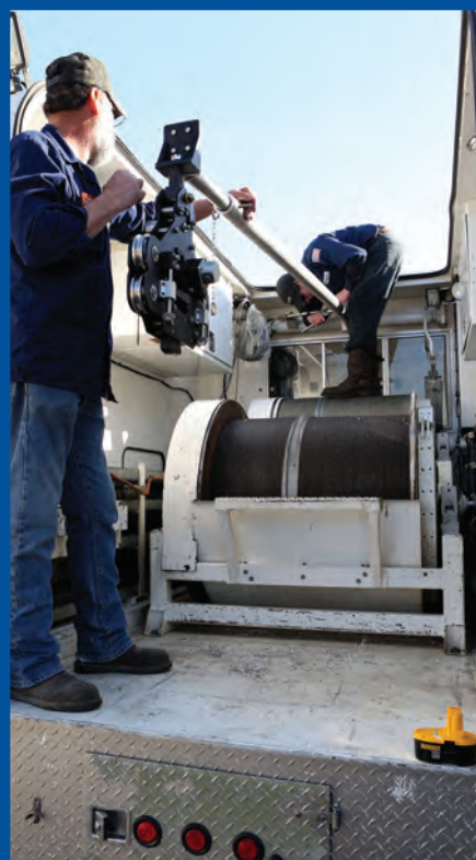
Various sizes of free point tools.