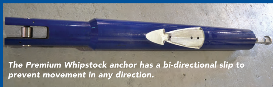
The Premium Whipstock anchor has a bi-directional slip to prevent movement in any direction.